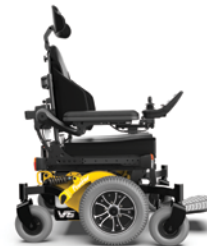
SUNRISE YELLOW BASE GREY URBAN TYRES