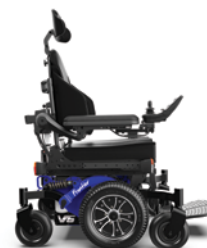
SPACE BLUE BASE BLACK URBAN TYRES