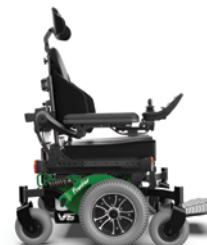
FOREST GREEN BASE GREY URBAN TYRES